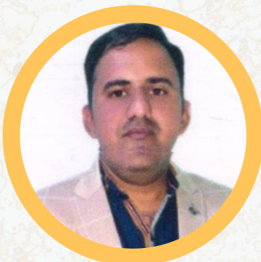
A PALIWAL ENTERPRICES