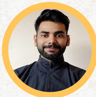
PANT COMPUTER CLASSES