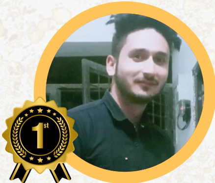
AROHI COMPUTER CENTER