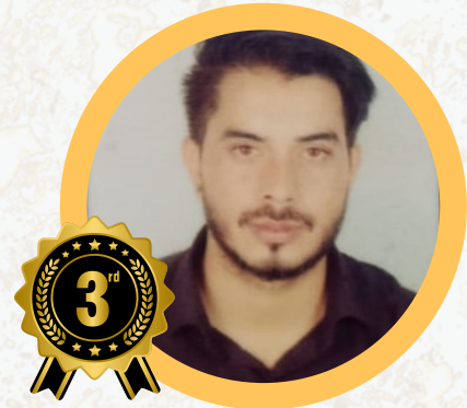
CREATIVE ART STUDIO