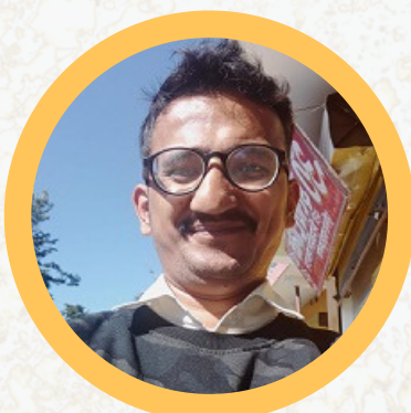
MAA VINDHWASHNI COMMUNICATION