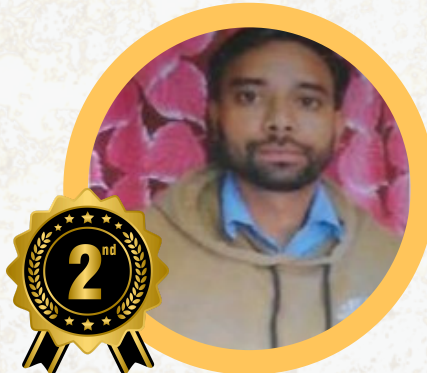
DEV BHOOMI COMPUTER TRAINING INSTITUTE