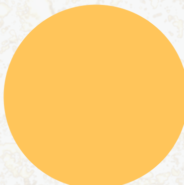
STAR NET COMPUTER INSTITUTE