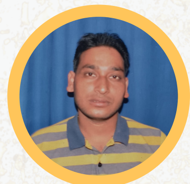
ANSHUMAN COMPUTER EDUCATION INSTITUTE